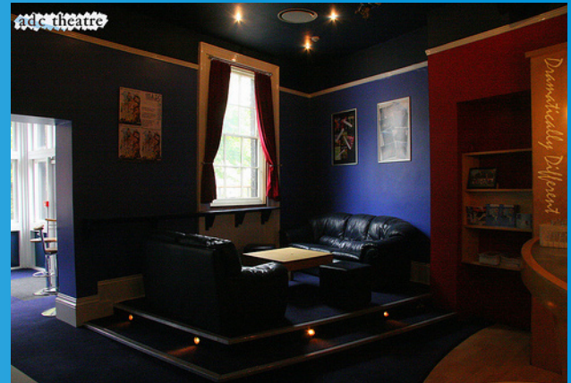
The new prompt side wing space and the redecorated bar.